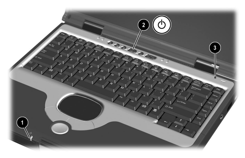
Identifying the power/standby light, power button, and display switch

The procedures for using Standby, Hibernation, and Shutdown use the power/Standby light ①, the power button ②, and the display switch ③.